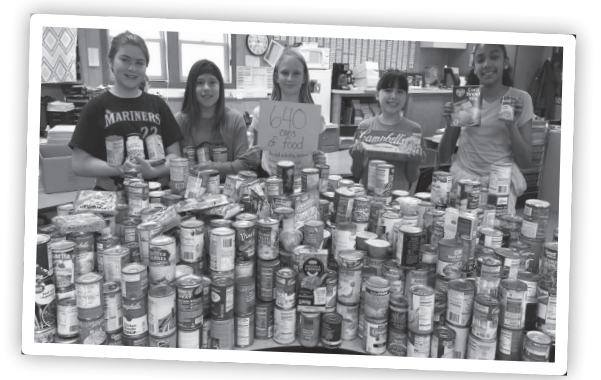
Canyon Lake Elementary held a food drive for Cornerstone. Look at all that food!