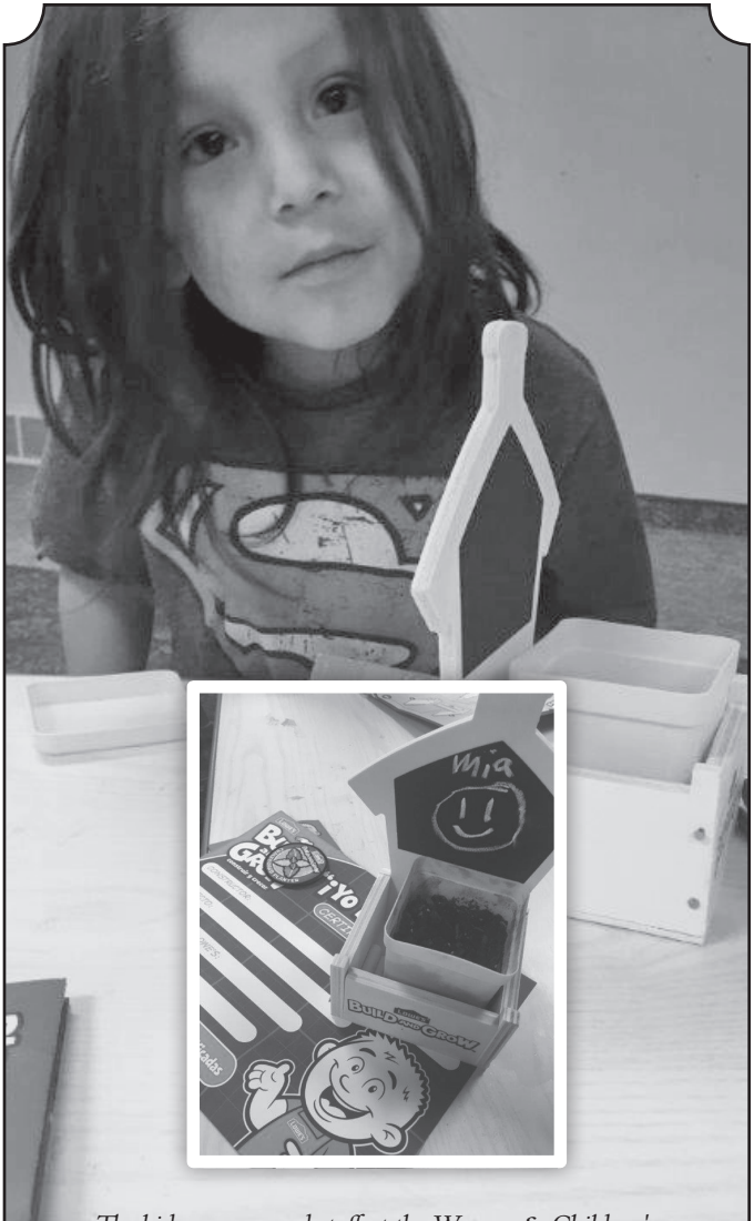
The kids, moms, and staff at the Women & Children's Home had fun building these cute little planters donated by Lowe's. The kids actually nailed them together!