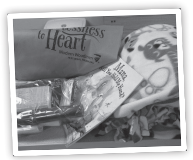
Modern Woodmen donated overnight bags for the kids at the Women & Children's Home. These contained a blanket, a book, and hygiene items. How fun!